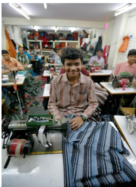
A textile factory in Bangladesh

This option runs on Wednesdays in Michaelmas Term 2.00-4.00pm in the Ground Floor Seminar Room at OSGA , 11 Bevington Road