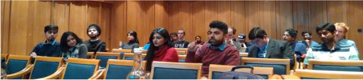
Seminar on Demonetisation November 2016