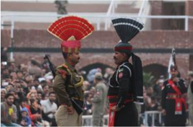
The beating retreat ceremony at Wagah Border of India-Pakistan (Courtesy Gargisharma13).

This option runs on Fridays in Michaelmas Term 11.00am-1.00pm in the Ground Floor Seminar Room at OSGA , 11 Bevington Road