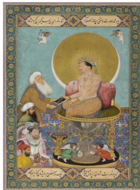
The emperor Jahangir preferring a Sufi Shaikh to Kings, c. 1615-18

Far-reaching social and economic changes took place across the Mughal world during what historians call the 'early modern' centuries. The inflow of silver enabled states across the region to begin to make their transactions in cash. Peasant communities in ecologically favoured areas moved into cash cropping for the market. The growth of gentry elites in the towns saw new markets for luxury goods of all kinds, from paintings and fine manuscripts, to cloth, jewellery and metalwork. The new importance of cash and commerce brought merchant and banking families to new positions of India-wide influence and power. These were centuries of great social mobility, as skilled people of all kinds – craftsmen, peasant farmers, military men, scribal people and service communities moved into and across the subcontinent in search of opportunity.