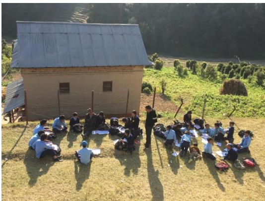
A school in Nepal

This option runs on Tuesdays in Hilary Term 11.00am-1.00pm in the Ground Floor Seminar Room at OSGA , 11 Bevington Road