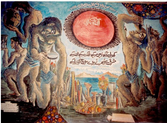
Syed Sadequain Ahmed Naqvi. Aftaab-e-Taaza , an illustration of poetry by Iqbal

This option runs on Fridays in Hilary Term 2.00-4.00pm in the Ground Floor Seminar Room at OSGA, 11 Bevington Road