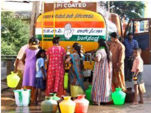
Water queues and election politics

This option runs on Thursdays in Michaelmas Term 11.00am-1.00pm in Seminar Room 2 at ODID, Queen Elizabeth House, Mansfield Road