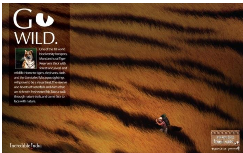
A promotional poster by the Indian state that draws upon the very same categories and visual tropes through which anthropological knowledge of South Asia has traditionally been constructed.

This option runs on Wednesdays in Hilary Term 2.00-4.00pm in the Institute of Social and Cultural Anthropology , 51-53 Banbury Road.