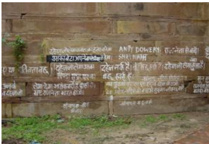
The image above shows graffiti protesting against dowry, Allahabad Fort, c. 2003.