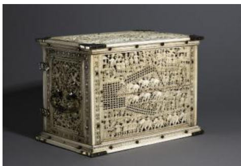
Ivory cabinet, 1600s, Sri Lanka, © Ashmolean Museum

This option runs on Thursdays in Hilary Term 2.00-4.00pm in the Eastern Art Study Room 2 (Level 1 – off Gallery 30) at the Ashmolean Museum